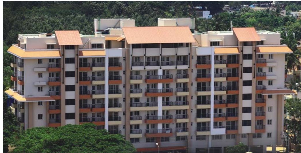
Aerial view of Donata Marvel, B. E. L. Road